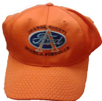
Orange Cap $9.25