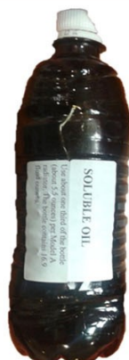
Soluble Oil $4.00