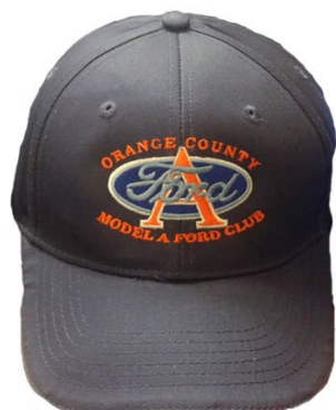
Blue Cap $9.25