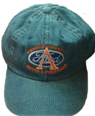
Denim Cap $12.00