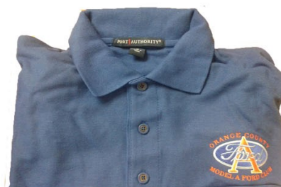
Polo Shirt $23-$25