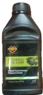
Steering Box Lube $18.00

Check with the O'Briens for Additional Items