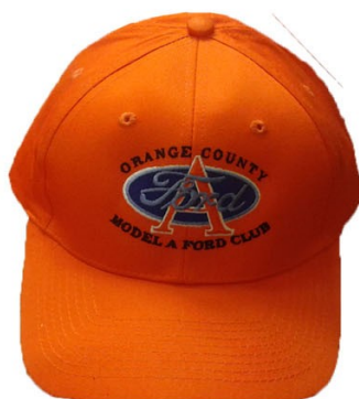
Orange Cap $9.25