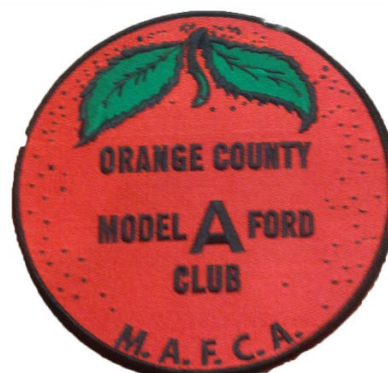
Lg Patch $15.00